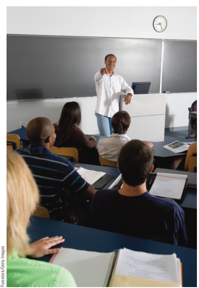
Photo 1–2 The students of teachers who were trained in teacher education programs and certified by their states score higher on standardized achievement tests than do the students of noncertified teachers.

reported higher levels of satisfaction with the quality of their training than did teachers who earned their certification through such alternate means as the Teach for America program, New Teachers Project, and Troops to Teachers program. In one survey, 80 percent of traditionally trained and certified first-year teachers felt they were prepared for their first year of teaching, whereas only 50 percent of alternate-route teachers felt adequately prepared. Similarly, 74 percent of traditionally trained teachers felt they spent enough time working with classroom teachers during their training, whereas only 31 percent of alternate-route teachers felt that way (National Comprehensive Center for Teacher Quality & Public Agenda, 2008c).