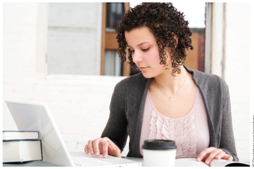
Photo 1–1 The information in this book can help you be a better teacher for three reasons: teaching is a complex activity that requires a broad knowledge base, many instructional practices are supported by research, and teachers who are knowledgeable about that research are better teachers.

The first part of our argument is that teaching is not the simple, straightforward enterprise some people imagine it to be. In fact, it ranks in the top quartile on complexity for all occupations (Rowan, 1994), and several analyses include teachers in the same occupational group as accountants, architects, computer programmers, counselors, engineers, and lawyers (Allegreto, Corcoran, & Mishel, 2004; U.S.